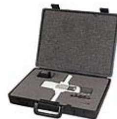
Optional large carrying case

Model FB-PA is a mechanical tester mounted with PA-7A test fixture to check the puncture resistance or hardness of materials like dry wall, foam boards, cardboard, etc. The test fixture is extremely rugged, all stainless steel construction, which features a pin encased by a spring loaded housing. Pressure on the housing exposes the stainless steel pin which penetrates the test sample to a consistent depth adjustable to 0.5". Ideal for handheld penetration tests or mounting to a test stand. Available in two ranges. OH-1 optional handle is also available.