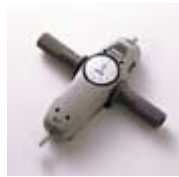
OH-1 Optional Handle